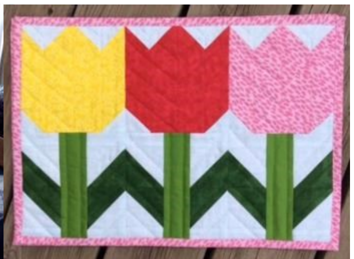
Peggy Skillen placemat